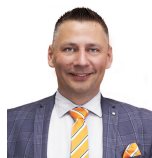
Veli Velebit 0433 246 847

Type: House Land: 405 m2 Building Size: 320 m2